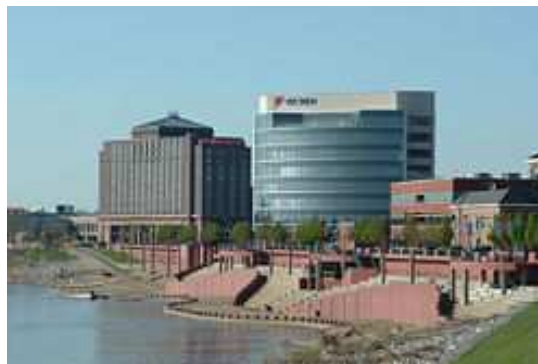
Downtown Evansville riverfront

Other great BSI gear such as hoodies, track suits, mugs, clocks, mouse pads (and more!) may be purchased from our online store: http://www.cafepress.com/boomsquadinc